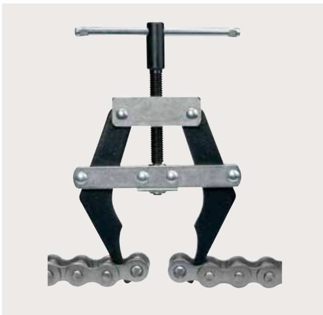
Chain puller 125 mm

Accessories: Screw A Screw B Replacement pin C